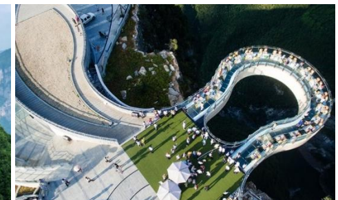
Longgang National Geopark