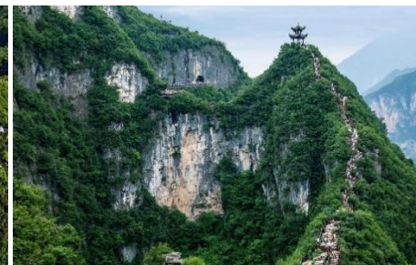
Longgang National Geopark