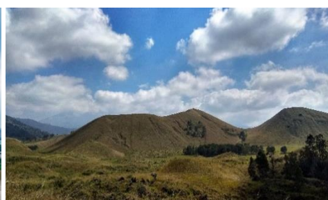
Fairy Mountain National Forest Park