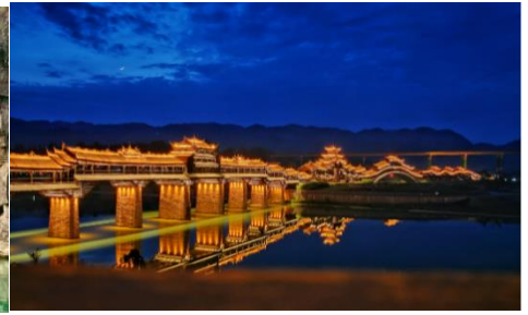
Zhuoshui Covered Bridge