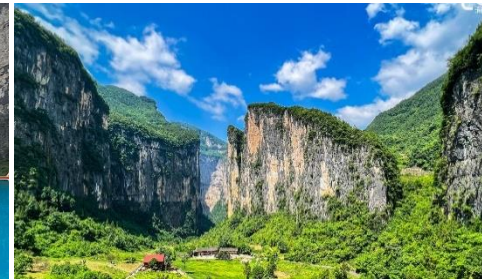
Han Kui Gate