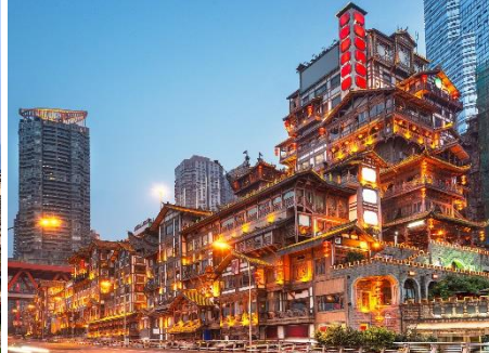
Night View of Hongyadong