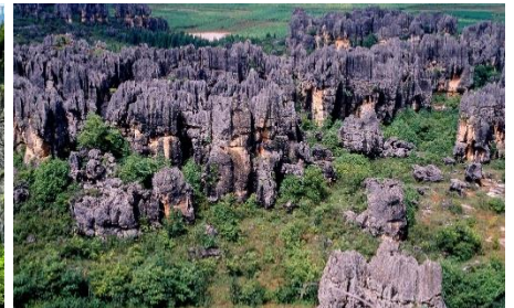
Suobuya Stone Forest