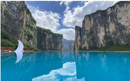
Three Gorges Scenic Area

After breakfast, proceed to Fengjie, with a stop at the Suobuya Stone Forest Scenic Area (including an electric tram). The Suobuya Stone Forest is renowned as the world's largest Ordovician stone forest, resembling an underwater labyrinth. The scenery is stunning, giving visitors the feeling of being in a fantastical prehistoric world. In the afternoon, visit the Three Gorges Original Township Scenic Area—Han Kui Gate . Kui Gate is the west gate of the Qutang Gorge and the western entrance to the Three Gorges. The Kui Gate section of the river is torrential and the high gorge stands on both banks, looking like guards at the entrance to the gorge.