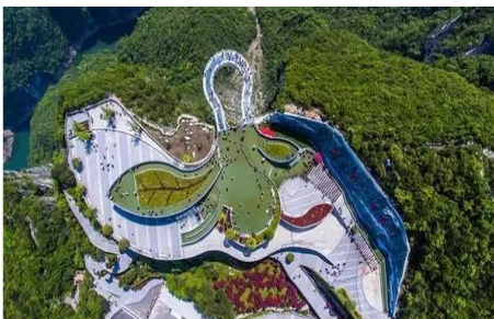
Longgang National Geopark

After breakfast, head to Longgang National Geopark (including an electric shuttle). This park is famous for its unique karst landscape and magnificent natural scenery, earning it the title of "Wonder of the World." The park spans a vast area, including the entire Qingshui Tujia Township, Yaoling Township, Yanping Township, and parts of Biaocao Township and Nixi Township, covering a total area of 217 square kilometers, with the core scenic area spanning 17 square kilometers. The park boasts spectacular natural sights, such as the Longgang Tiankeng, Cloud Bridge, Cliff Walkway, and Da'an Cave. Among these, the Longgang Tiankeng is a highlight, with a depth of 335 meters, making it the third largest in China and the fifth largest in the world. Its nearly vertical walls, with a slope close to 90 degrees, are extremely rare worldwide, earning it the nickname "The First Pit in the World."