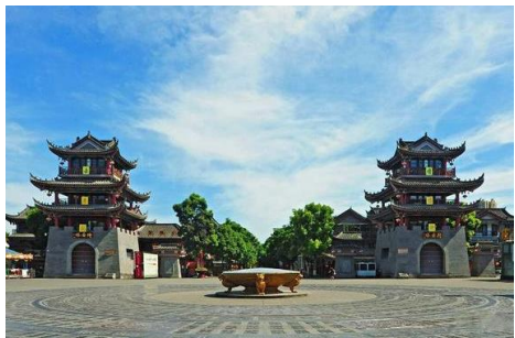
ChangShou Ancient Town

After breakfast, travel to Changshou and visit the ancient town of Changshou , known for its traditional architecture and streets. The town is home to numerous famous sights, including ancient streets, temples, traditional residences, and historical sites. The architectural style is reminiscent of the water towns of Jiangnan, featuring exquisite stone carvings, wood carvings, and brick carvings. After lunch, return to Chongqing, stroll through Jiefangbei Pedestrian Street , enjoy a Chongqing hotpot dinner (at your own expenses), and then experience a boat ride along the two rivers , admiring the night views of Chongqing's riversides.