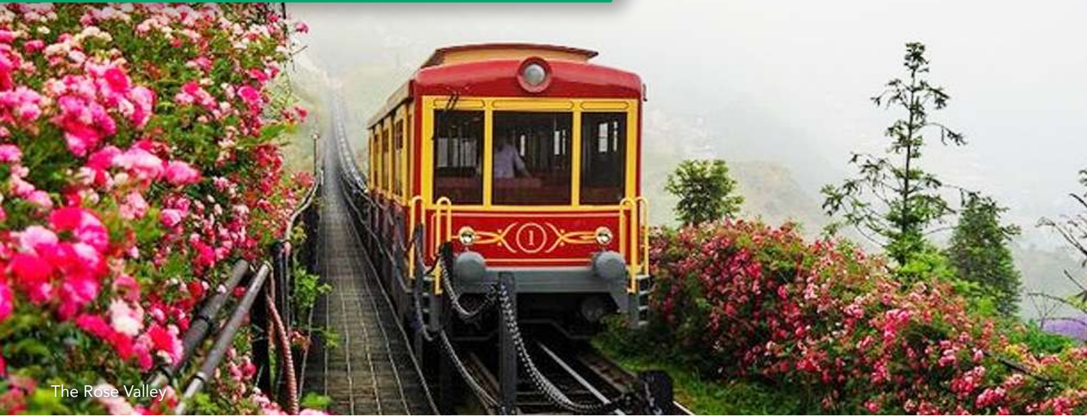
The Rose Valley