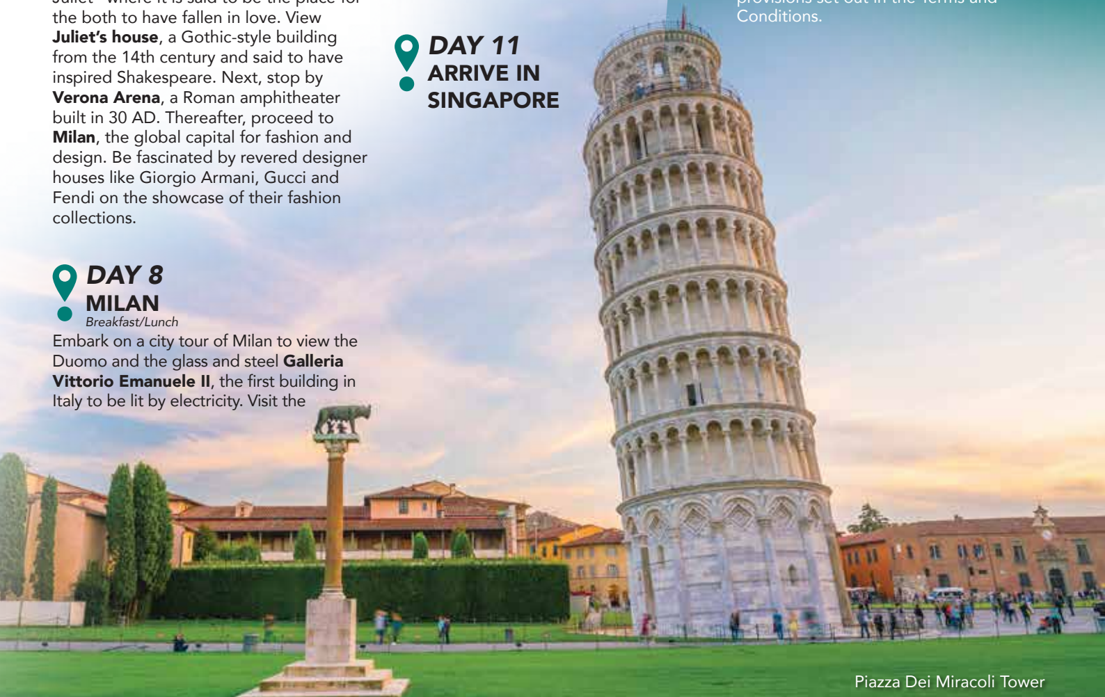
Piazza Dei Miracoli Tower