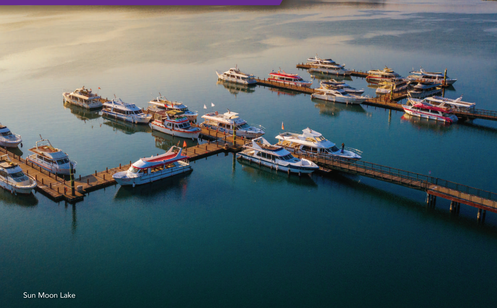
Sun Moon Lake