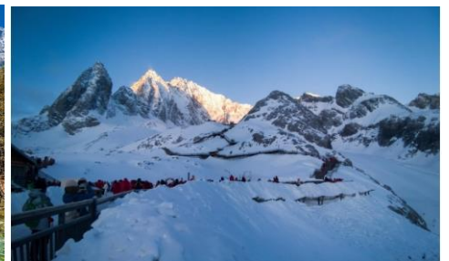
Yulong Snow Mountain