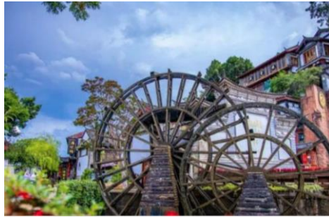
Dayan Ancient Town