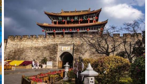
Dali Ancient Town