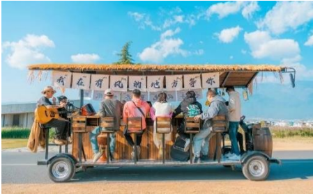
S Bend Music Convertible

After breakfast, ride in a Music convertible to tour Cangshan Erhai (with on-board singer Performances), enjoy the S Bend of Erhai ecological corridor. Then a local guide will lead the whole group in a Yunnan style Dancing, with the entire process captured in family photos and a group video (30-second duration). After that, visit Dali Ancient Town and Foreigner Street