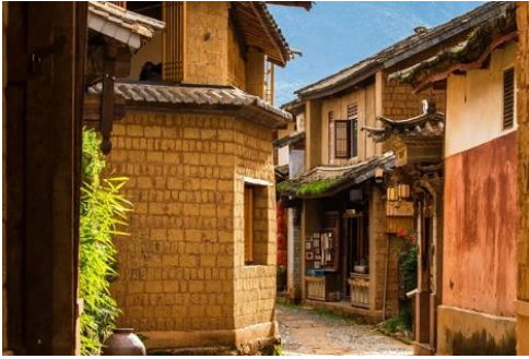
ShaXi Ancient Town