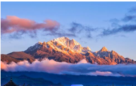
Yulong Snow Mountain

*Note: 1. If the Ice Tower Forest Cableway encounters cableway maintenance or is out of service due to strong winds, it will be changed to Yunshanping Cableway + Plank Road Battery Car, and there will be no refund or compensation for the price difference. 2. If "Impression of Lijiang" is suspended due to the performer's reasons, the Travel Agency will not make compensation.