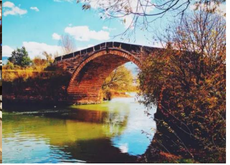
ShaXi Ancient Town