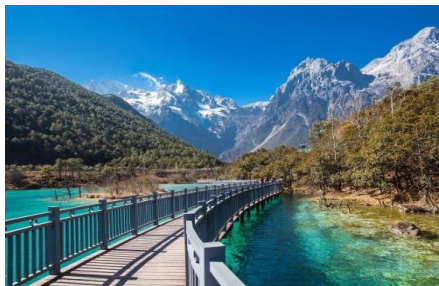
Blue Moon Valley