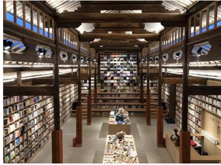
Vanguard ShaXi Bai Nationality Bookstore