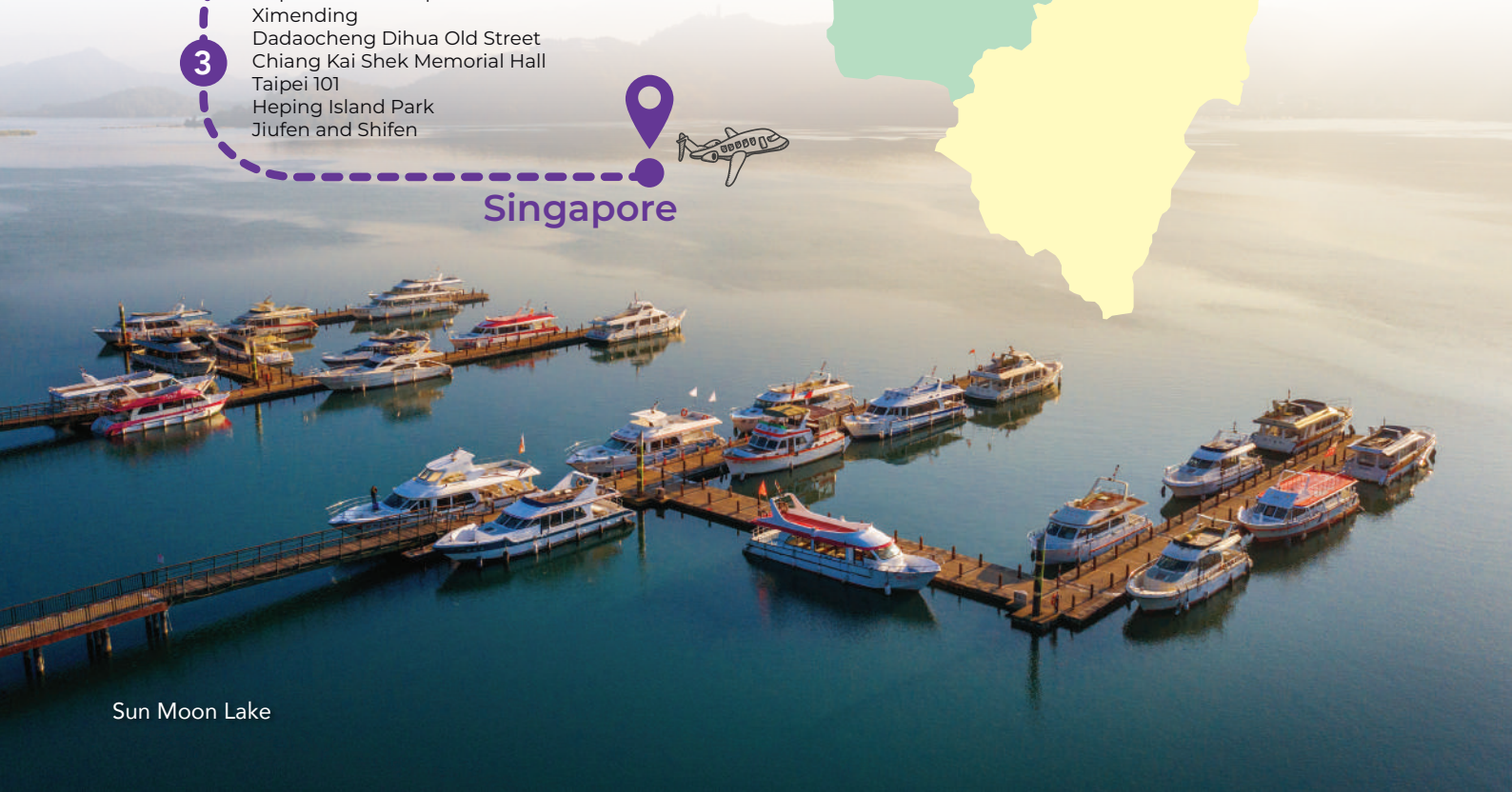
Sun Moon Lake