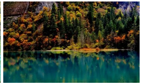
Jiuzhai Valley Scenic