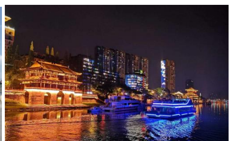
Leshan River Tour