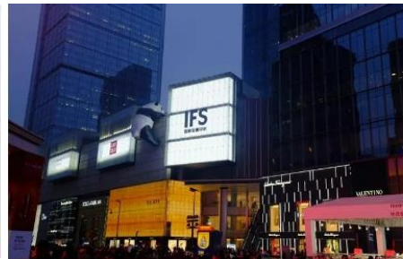
IFS Shopping Mall