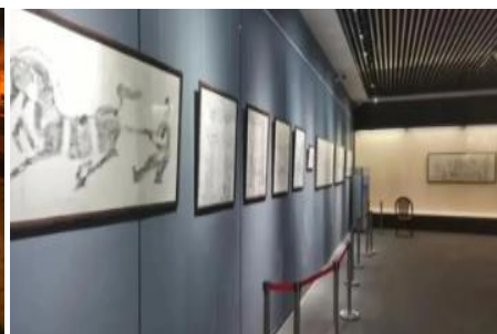
Mount Emei Art Museum