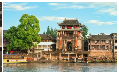
Huanglongxi Ancient Town