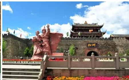
Songpan Ancient City

DAY 3 JIUZHAI VALLEY (Breakfast/Lunch/Dinner) EQUIVALENT