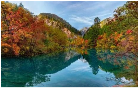
Jiuzhai Valley Scenic