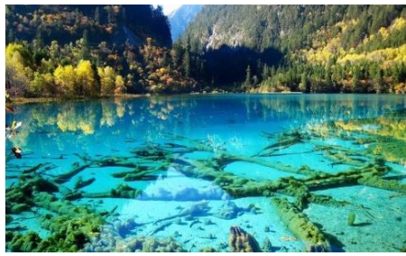
Jiuzhai Valley Scenic