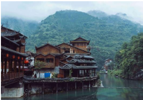
MoRong Miao Village

After breakfast, visit MoRong Miao Village , "MoRong" meaning "place with dragons" in the Miao language, experiencing the cultural customs of the Chinese ethnic minority village. Then, We will head to Tianmen Mountain National Forest Park (including the cable car, scenic area shuttle bus, and the mountain-crossing escalator), an awe-inspiring nature reserve. Next, you will have the opportunity to experience the Glass Skywalk (shoe covers included), walking along the cliff edge on a transparent glass floor, thrillingly taking in the breathtaking views below. We will also visit Tianmen Cave , a magnificent natural stone cave renowned as the highest natural arch in the world.