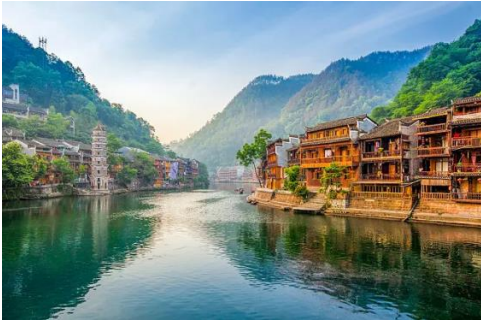
Fenghuang Ancient Town