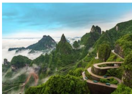
Tianmen Mountain National Forest Park