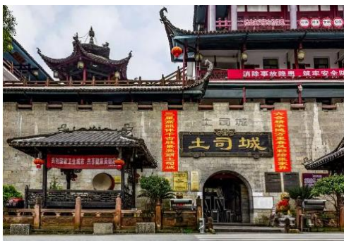
Tujia Folk Custom Park

After breakfast, visit the Tujia Old Ethnic Village in Zhangjiajie. Originally known as Yongding Tujia Folk Custom Park , it is an ancient Tujia mountain village featuring the impressive 48-meter tall stilted houses. These houses are built entirely without nails, a marvel in the architectural history of Tujia stilted houses. Then, proceed to the Junsheng Painting Institute to appreciate the delicate beauty of art. Afterward, explore the Ten-Mile Gallery (including a round-trip on a small train).