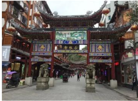
Phoenix Town Stone-paved Streets