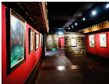
Junsheng Painting Institute