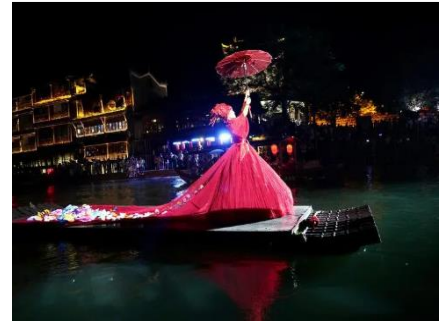
Meeting on the Tuo River