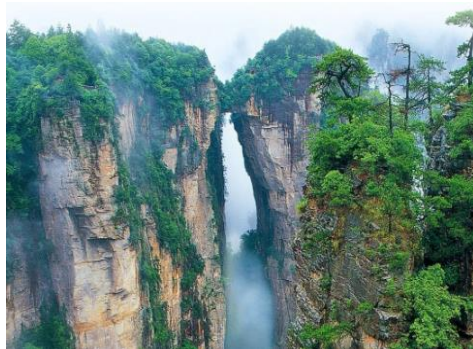
First Bridge in the World