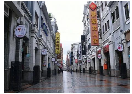
Shangxiajiu Pedestrian Street