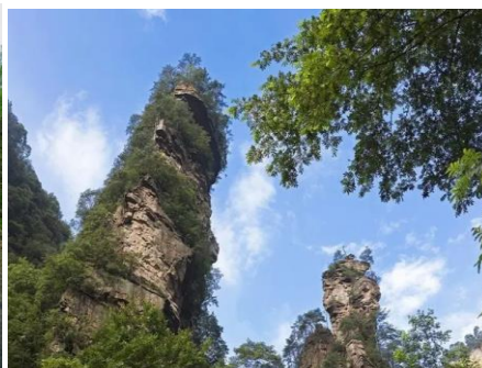
Water Surrounds Four Gates